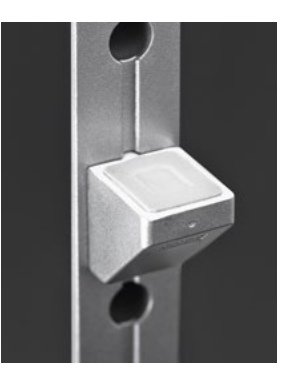
The very robust shelf and element supports are fixed into place simply and securely with a 90° turn.

Functionality down to the very last detail: the rows of holes are closed, protecting them from dust and moisture.